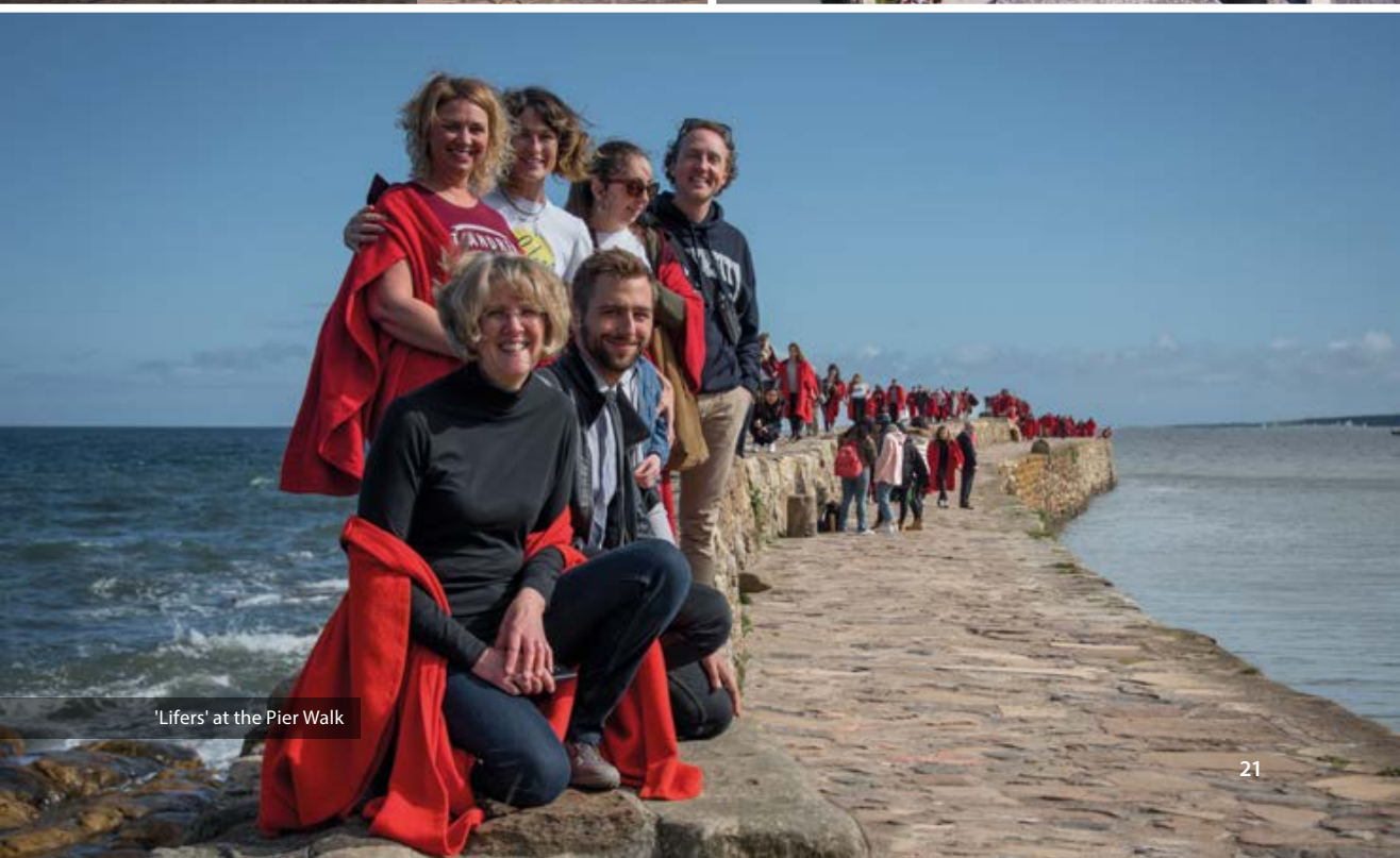
'Lifers' at the Pier Walk