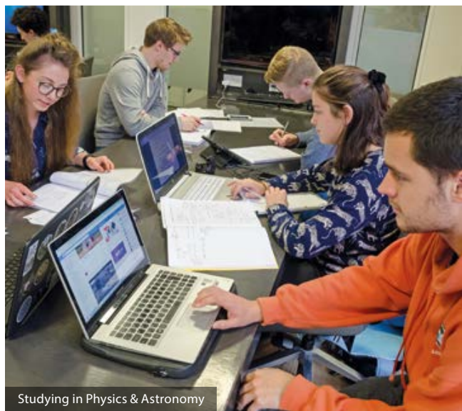
Studying in Physics & Astronomy