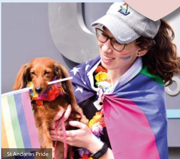
St Andrews Pride