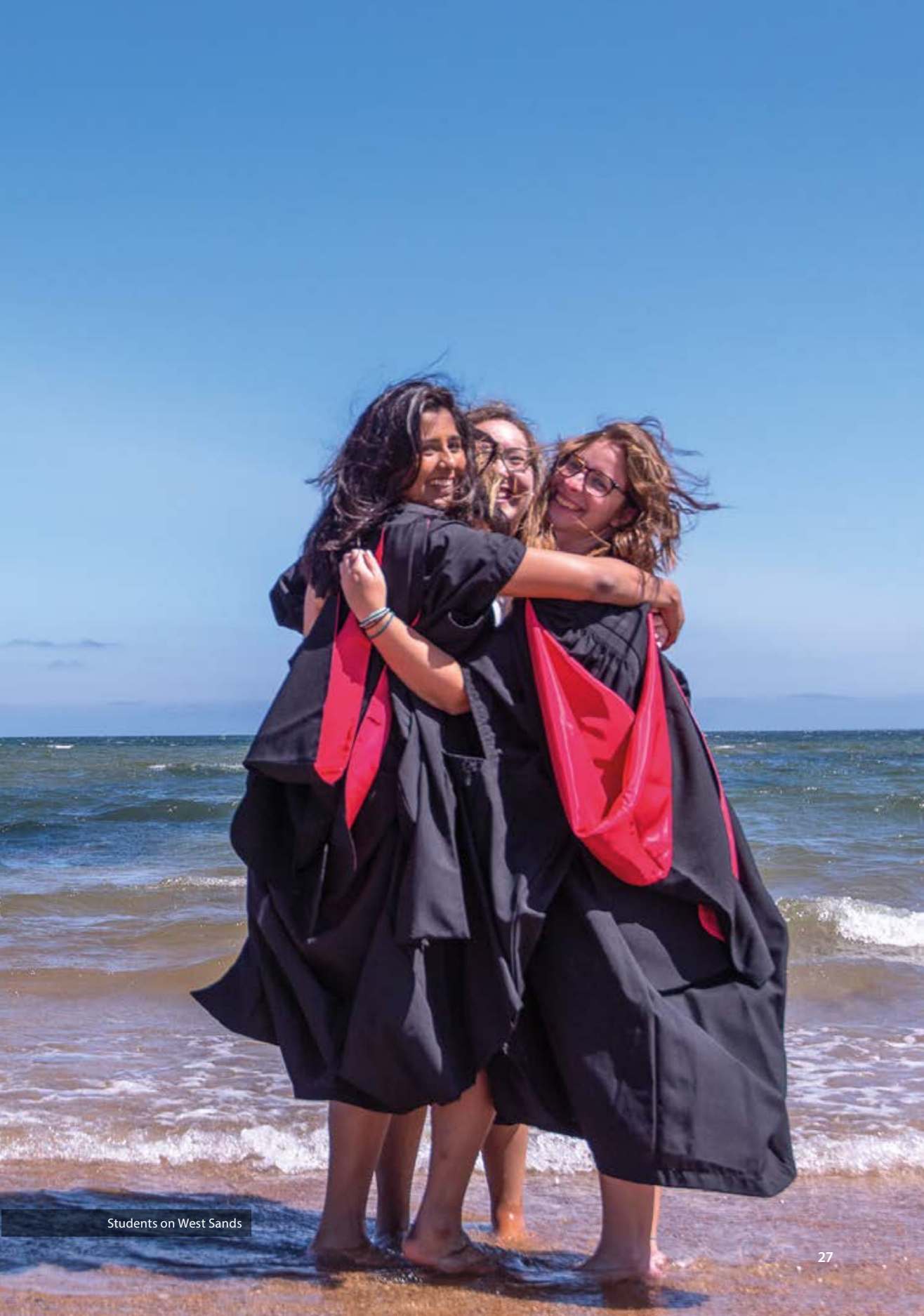
Students on West Sands