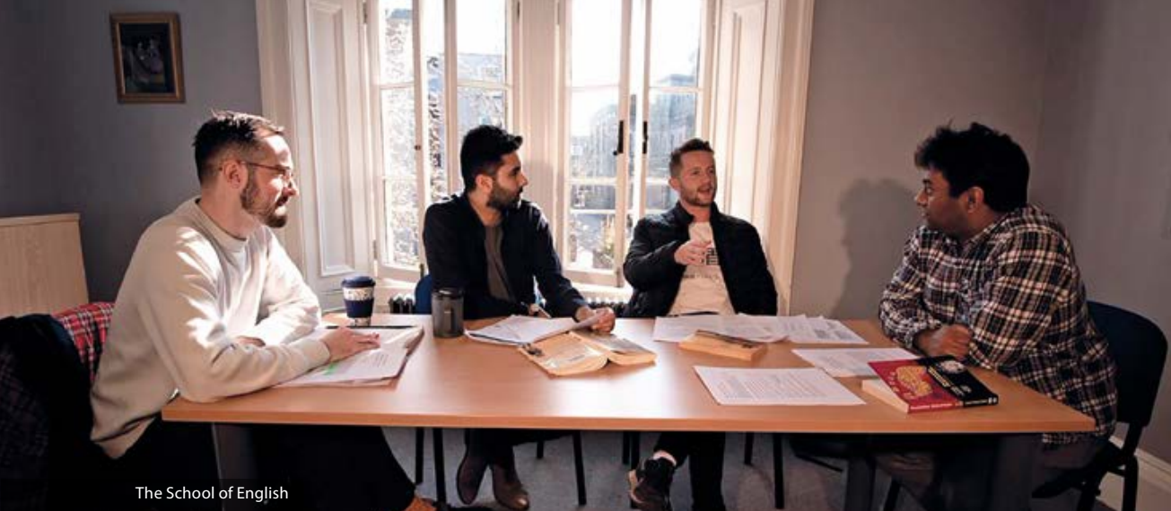
The School of English