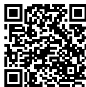
Fees and funding

Explore our scholarships: www.st-andrews.ac.uk/study/fees-and-funding/scholarships