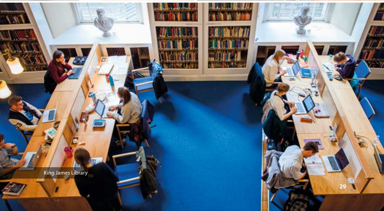
King James Library