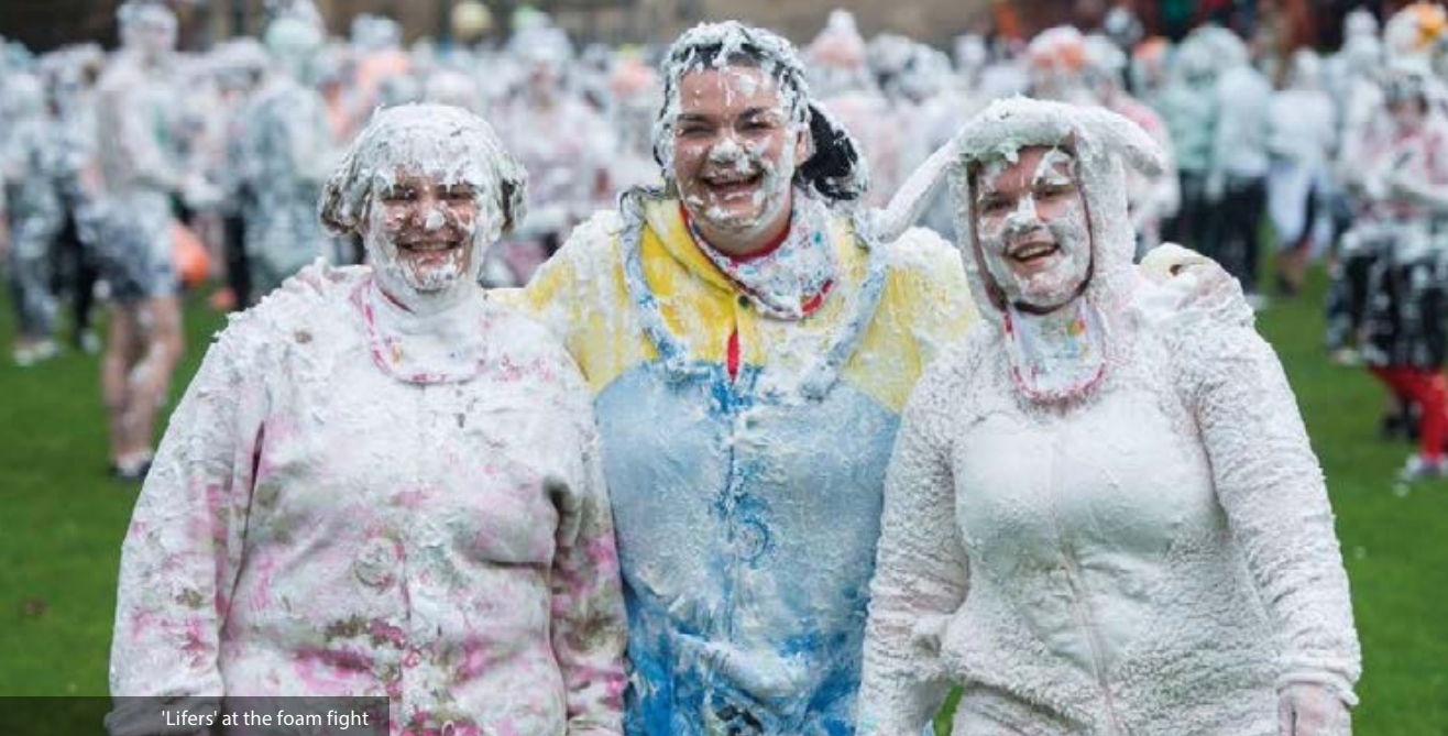
'Lifers' at the foam fight